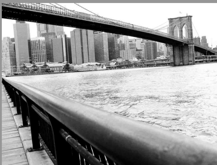
See Dan's images for sale www.danmarinophoto.com

By placing warm, nostalgic, and beautiful photographs in your house you are complementing your interior design to make a home with imagery that defines you.